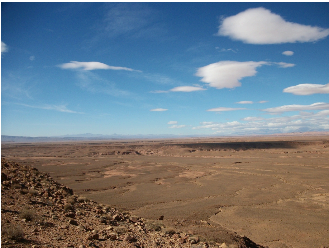
Canyon to the west of the site