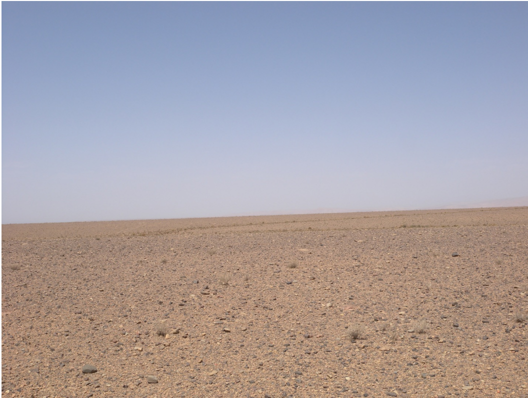
Sand and Gravel plateau