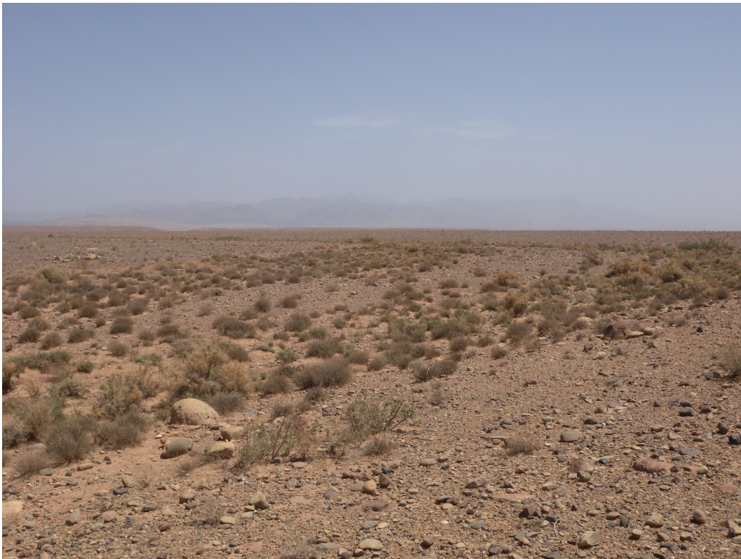
Chaaba running through the site